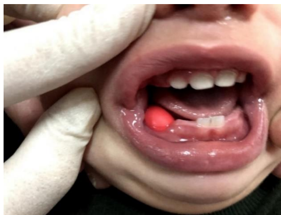
Figure 1. light red swelling in the first molar area

A week later, the child was re-examined and no change was observed in the clinical appearance, but the child's feeling of discomfort during feeding was resolved. Due to parents' non-cooperation for face-to-face visits, future follow-ups were done by phone. One week after the first follow-up, the mother stated that a piece of the "Pop It" toy came out of the child's mouth and the gingiva appeared normal (Figure 3). "Pop It" is a kind of toy loved by children, which is made of silicone and reduces the child's stress (Figure 4). Two weeks after the removal of the piece of toy, the primary first molar tooth grew normally. In an examination six months later, the clinical appearance of the gingiva was normal and no special problem was observed (Figure 5).