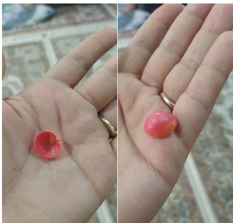
Figure 3. The piece taken out of the child's mouth