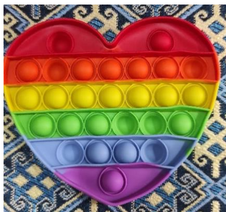
Figure 4. "Pop It" toy