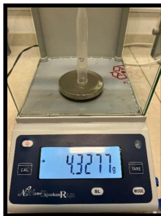
Figure 1. Weighing uncapped tubes on a scale with an accuracy of 0.0001 g

In this study, the distal canal of a mandibular second primary molar was used to standardize the samples. In the reciprocal group, the distal roots of the teeth were prepared to working length using a WaveOne Gold file (Dentsply Maillefer, Ballaigues, Switzerland) and a Woodpecker Endosmart plus rotary device (Woodpecker, Guilin, China) with torque settings of 2 N/cm 2 , speed of 300 rpm, and rotation of 30 degrees clockwise and 150 degrees counterclockwise. If the reciprocal rotary file did not reach working length, the file was removed and the flutes were cleaned, and after irrigating the root canal and performing pitting with a K File No. 10, the reciprocal file was reinserted and this process continued until working length was reached. 5 cc of sodium hypochlorite with a concentration of 25.5% (Chloraxid 5.25%, CerKamed medical company, Poland) was used to irrigate the root canal with a double-side-vented closed-end 30g needle (Tribest, Jiangsu, China) (29).