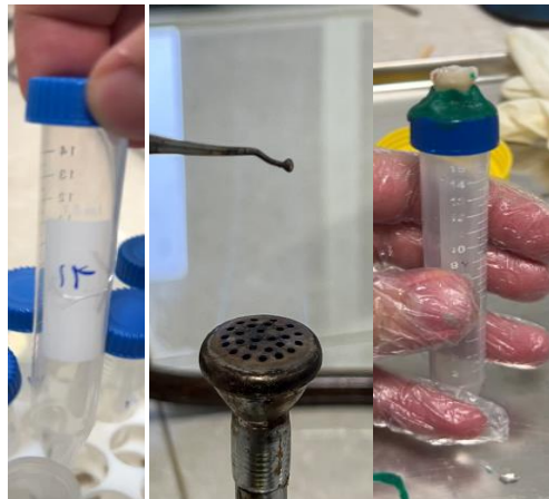
Figure 2. Numbering and mounting of teeth

In the conventional rotary group, the distal roots of the teeth were prepared to working length using M3 immature files (United Dental, Shanghai, China) (left to right) S x , S 1 , S 2 , F 1 , F 2 , F 3 and a rotary motor device with a torque setting of 2 N/cm 2 and a speed of 300 rpm. Due to the size of the distal canal, preparation was first performed with a file size 20 (yellow) and then a file size 25 (red). If the rotary file did not reach working length, the rotary file was inserted again by performing a patency with a K File No. 10 and this process was continued until working length was reached. 5 cc of sodium hypochlorite with a concentration of 25.5% was used to irrigate the root canal with a double-side-vented closed-end 30g needle (28).