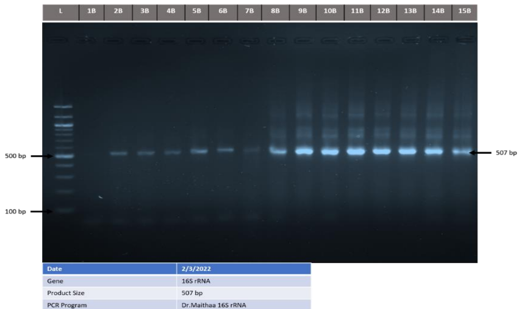
Figure 2. Electrophoresis of 16srRNA gene for children with severe caries