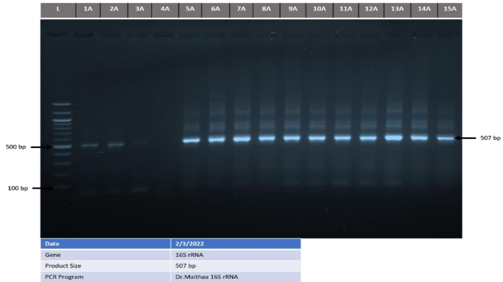
Figure 1. Electrophoresis of 16srRNA for caries free children