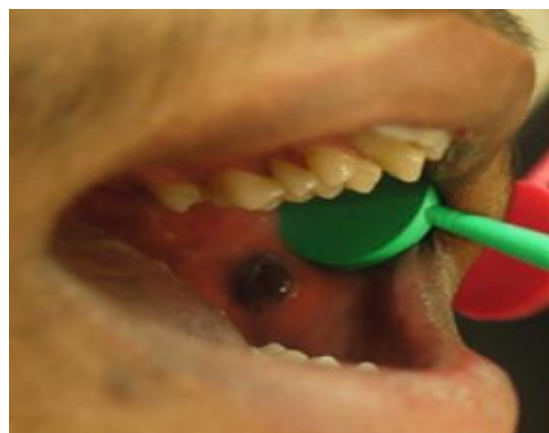
Figure 1. Black polypoid nevus

The lesion was removed by excisional biopsy and maintaining a safe margin and a tissue sample was sent for histopathological evaluation. The macroscopic specimen was a brownish-gray lesion with elastic consolidation which was seen in the microscopic view of benign proliferation of nevus cells and melanin production in the connective tissue. Due to the fact that the blue nevus is an accumulation of elongated and narrow nevus cells with dendritic appendages and are located deep in the dermis or lamina propria, the lesion was differentiated from the mucosal nevus and the final diagnosis of the lesion was mucosal nevus. The patient referred for regular six-month examinations for two years, during which time no recurrence or similar symptoms were observed in the oral mucosa.