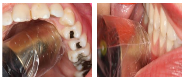
Figure 1. How to place the laser probe in the buccal apex area (right), how to place the laser probe in the lingual apex area (left)

a power of 200 mW was used, and the radiation method was spotted. The location of the laser irradiation on the root surface was beyond the bone of the buccal and lingual surfaces of the sensitive teeth. The apex of posterior teeth was laser irradiated for 3 minutes (90 seconds from the buccal and 90 seconds from the lingual) (Figure 1).