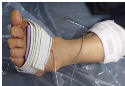
Figure 1. Electrode Installation: Cathode installed near the Wound (Ulcer located on the First Dorsal Metatarsal Artery)/Anode placed in the Proximal Tibia

stimulation. Since this was a single-blinded study, all intervention processes were identical between the two groups of electrical stimulation and placebo, and the patients remained unaware of treatments.