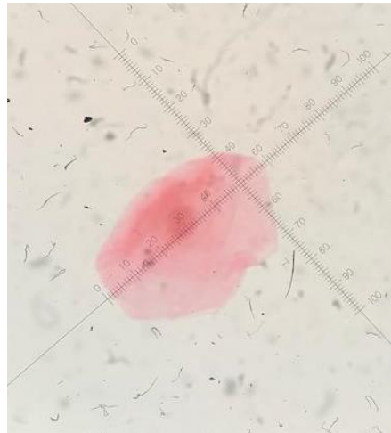
Figure 1. Oral epithelial cell with 100 magnification and with Papanicolaou staining and measurement based on micrometer

A systematic approach was utilized to randomly select and measure three areas and fifty cells within each patient in a cohort of 50 people. The cellular images were captured using a digital color video camera, with a magnification of 40 and 100, respectively. The areas of the nucleus (NA) and cytoplasm (CA) were quantified by delineating the nuclear and cell border areas in square micrometers. Analysis was conducted using the system's digital cursor in image mode, and the NA/CA ratio was subsequently obtained. In lens 4: the obtained number was \times 25 , In lens 10: the obtained number was \times 10 , In lens 40: the obtained number was \times 2.5 , In lens 100: the obtained number was not multiplied by a number because it was in magnification \times 100 (Figure 1).